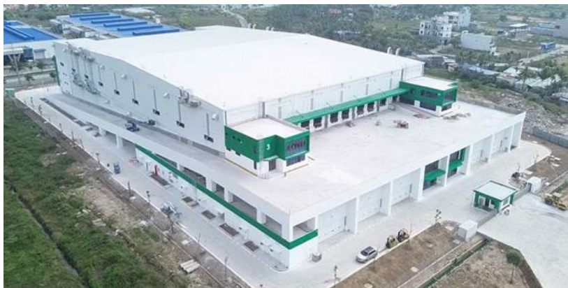
External view of Sembcorp Logistics Park (Thuy Nguyen)